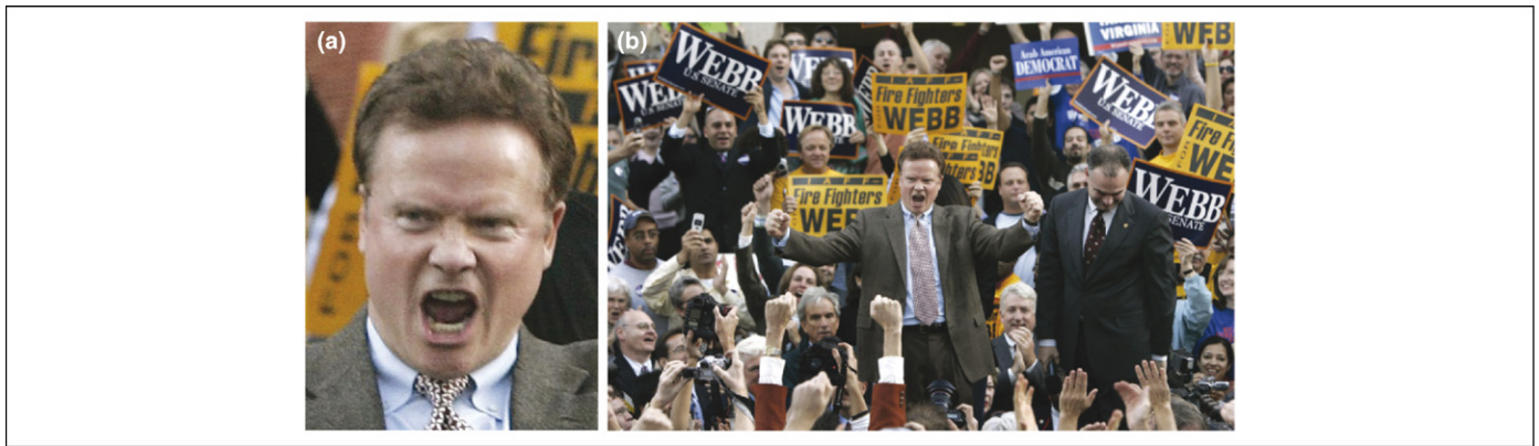
Figure 1. The role of context in emotion perception. Look at United States Senator Jim Webb in (a). Taken out of context, he looks agitated and aggressive. Yet look at him again in (b). When situated, he appears happy and excited. Without context, and with only the structural information from the face as a guide, it is easy to mistake the emotion that you see in another person. A similar error in perception was said to have cost Howard Dean the opportunity to run for President of the United States in 2004.

in a consistent and unambiguous way so that structural information on the face is sufficient for communicating a person's emotional state. As a consequence, experimental studies of emotion perception often rely on a set of fixed, exaggerated facial portrayals of emotion that were designed for maximum discriminability (Box 1).